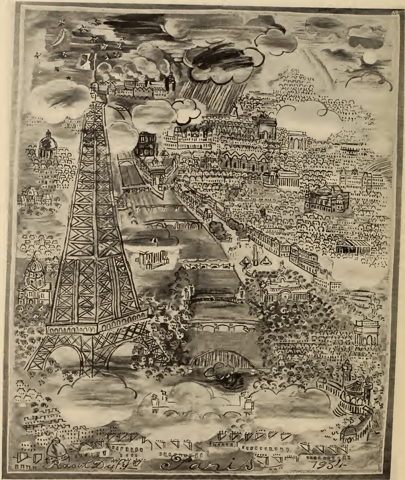
RAOUL DUFY — "Panorama de Paris"